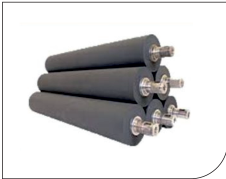
Printing Machine Roller